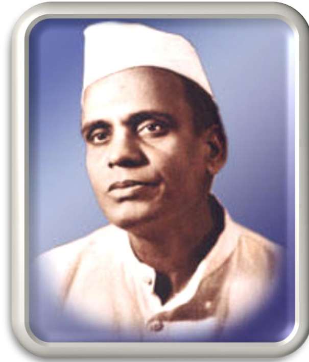
Late Sane Guruji